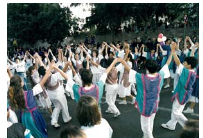
Community dancing school children in Karmiel

We believe that introducing traditional cultural heritages through the school curriculum is one of the best ways to preserve cultural heritages.