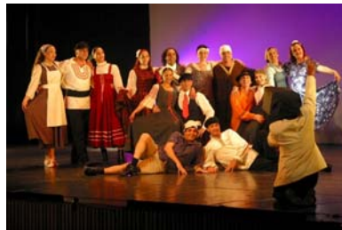
Pioneers Rondo Hora Jerusalem

The curriculum deals with issues such as: Why to preserve, what to preserve, how to do it. The curriculum include: teaching folk-dances to kindergarden children; using the school-day intermissions for folk dances; teaching folk-dances and their