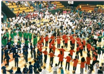
Community dancing school children in Jerusalem

CIOFF® Israel', the Israeli Folk-dance movement, and the Dance Dept. of the Ministry of Education – join hands in an effort to develop a National curriculum entitled "Preserving Israeli Cultural Heritage" - to be introduced in the schools.