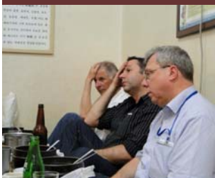
Bad News!!- The volcano ash is still hanging over Europe