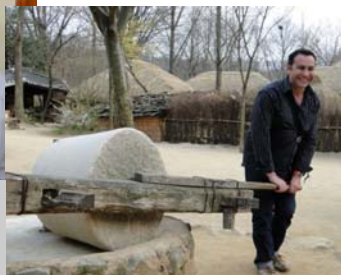
Turning the wheels of CIOFF®