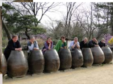
CIOFF® “Thinking tank”